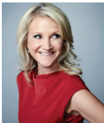
MEL ROBBINS CREATOR, ‘THE 5 SECOND RULE’ FRIDAY, OCTOBER 14 TH – 2:45 -4:15 P.M.