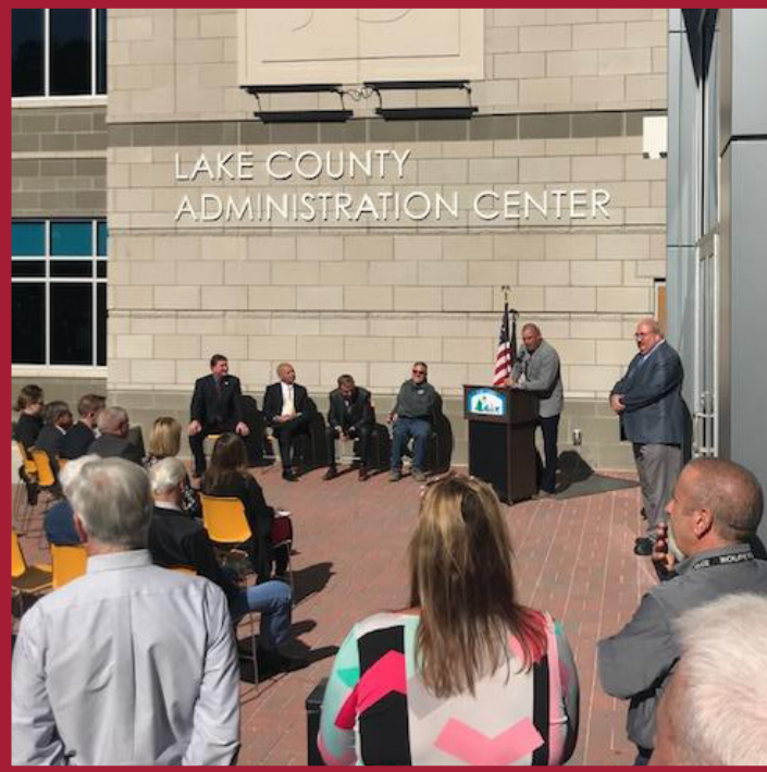
Lake County Administration Building