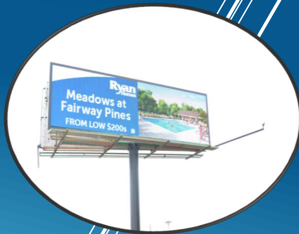
Rt. 2 – West Bound