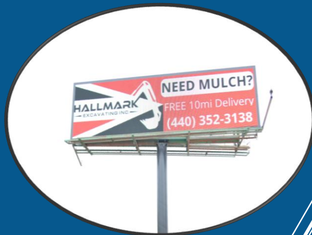
Rt. 2 – East Bound

Ads on billboards are free to consumers; you do not have to buy a magazine, cable TV, or a newspaper to see your advertisement.